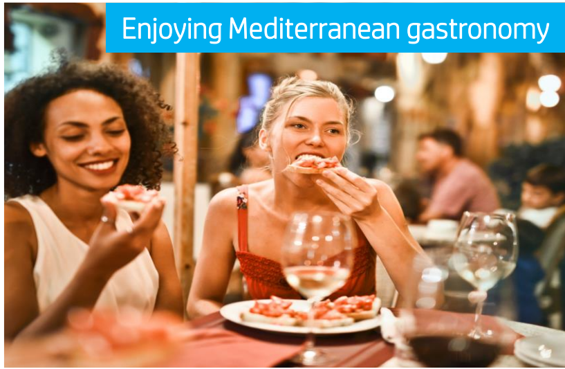
Enjoying Mediterranean gastronomy

After half a day of training and refining your skills, it's time to have some fun! Whether you want to go on cultural trips, team-building activities or something recreational like a barbeque by the beach or a night out to enjoy some fresh Mediterranean cuisine, we can make it happen. During your free consultation, let us know what you're looking for or get some advice from us and we can make it fit into your programme and your budget.