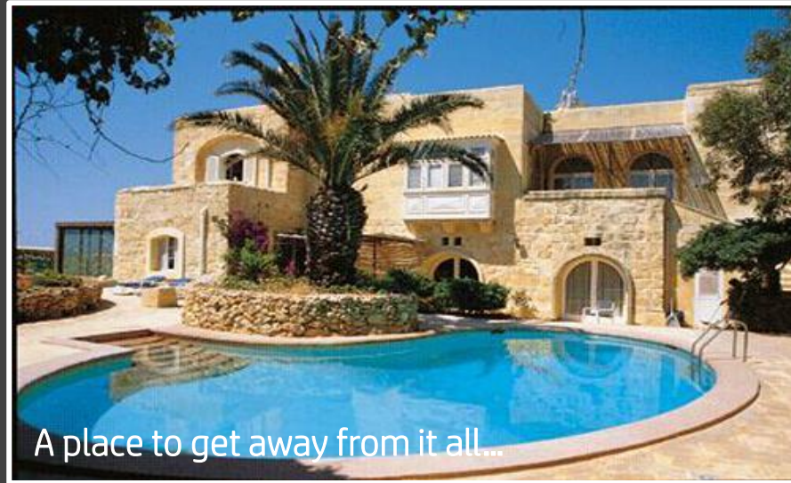
A place to get away from it all...